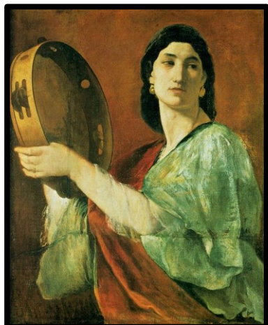
Anselm Feuerbach – "Miriam"

The prophetess Miriam was Moses' older sister, and she helped save him as a baby. Their mother left him in a basket to protect him from being killed by Pharaoh, and Pharaoh's daughter found him and took pity on him. Miriam offered up her mother to nurse him so that the two could remain together.